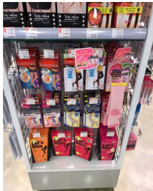
< drug store >