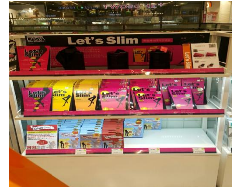
< drug store : OLIVEYOUNG >