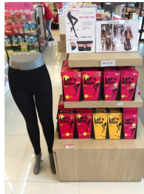
< duty-free >