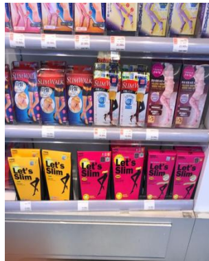
< drug store >