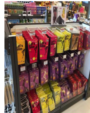
< duty-free >