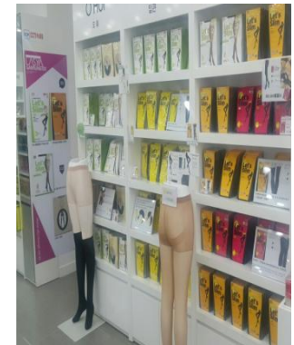
< duty-free >