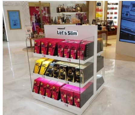
< duty-free : LOTTE >